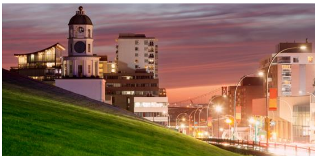
Halifax, Central Zone

In Nova Scotia, you're never more than 30 minutes from the ocean. With approximately 7500 kilometers of coastline, beaches, coastal trails, and incredible paddling are all right outside your door and waiting to be explored.