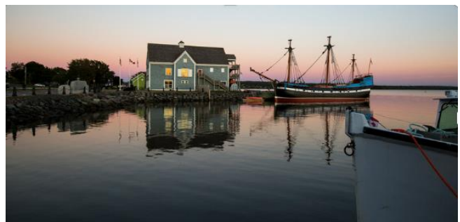
Pictou, Northern Zone

Just under one million people enjoy what Nova Scotia has to offer. From historical sites, wineries, award winning restaurants and a thriving arts and culture scene, Nova Scotia really does have it all.