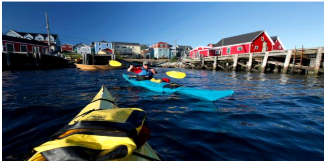
Lunenburg, Western Zone