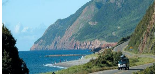
Cabot Trail, Eastern Zone

Nova Scotia offers four seasons of outdoor adventure. Kayak or hike along our coastline, snowshoe our trails, or dust off that bike and explore the trailways that connect our province. There is no shortage of outdoor fun!